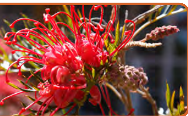
ABOVE: Joondalup Campus flora