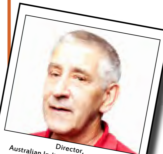
Director, Australian Indigenous HealthInfoNet