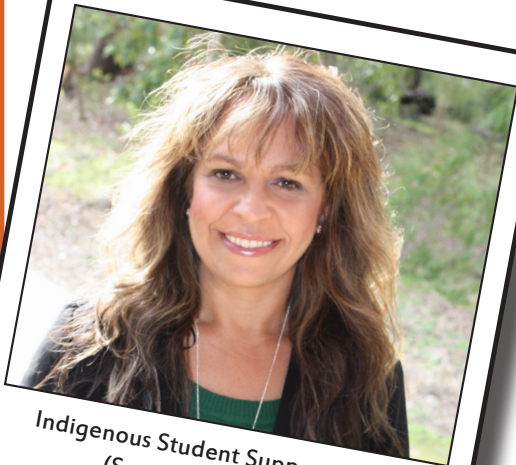
Indigenous Student Support Officer (South West Campus)