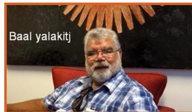
A screenshot of Dr Noel Nannup and one of the phrases from the Nyoongar Language Video Quiz

The seven english phrases and their Nyoongar translation can be found in the Wongi Nyoongar - Talking Nyoongar article on page 5.