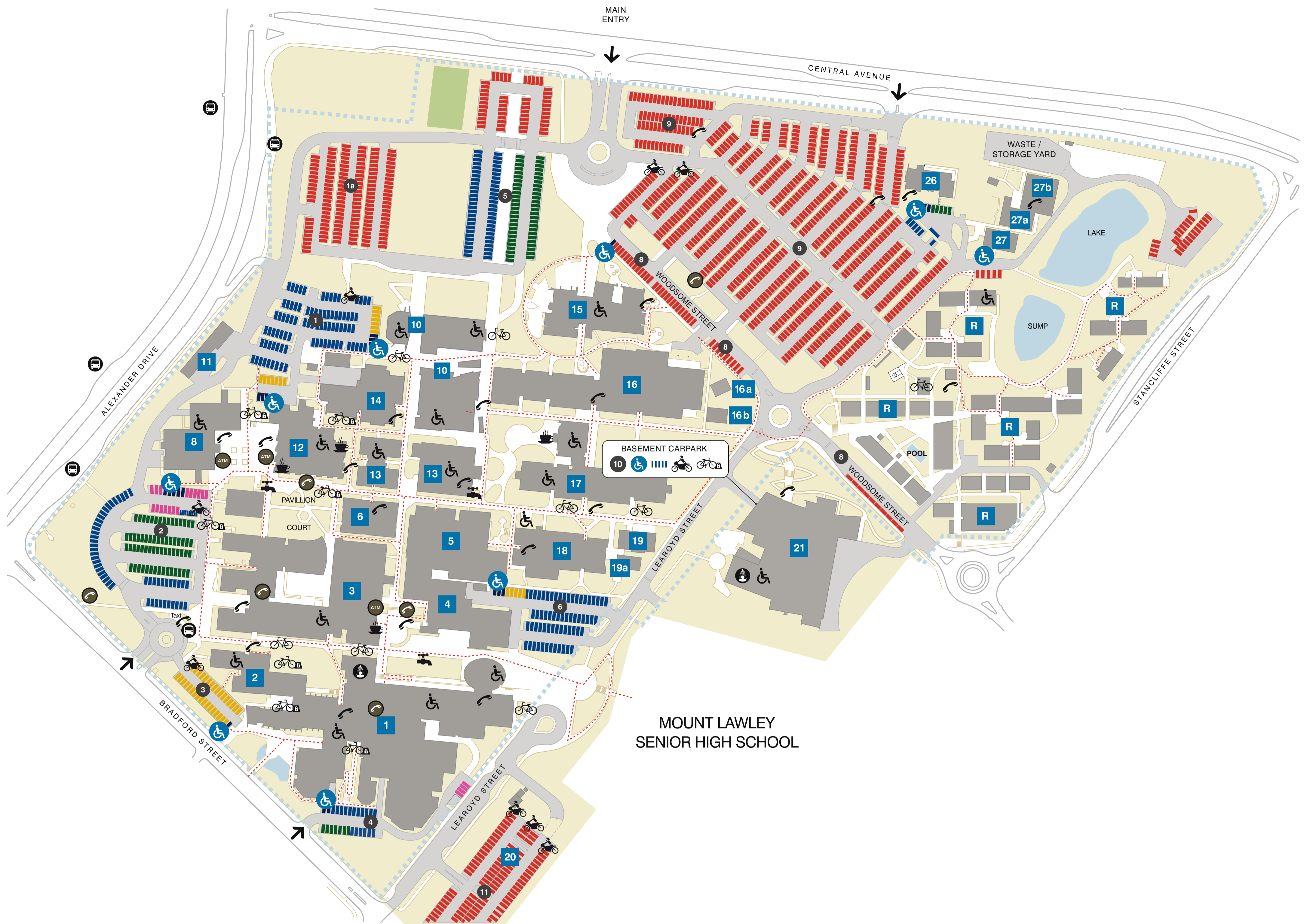
MOUNT LAWLEY SENIOR HIGH SCHOOL