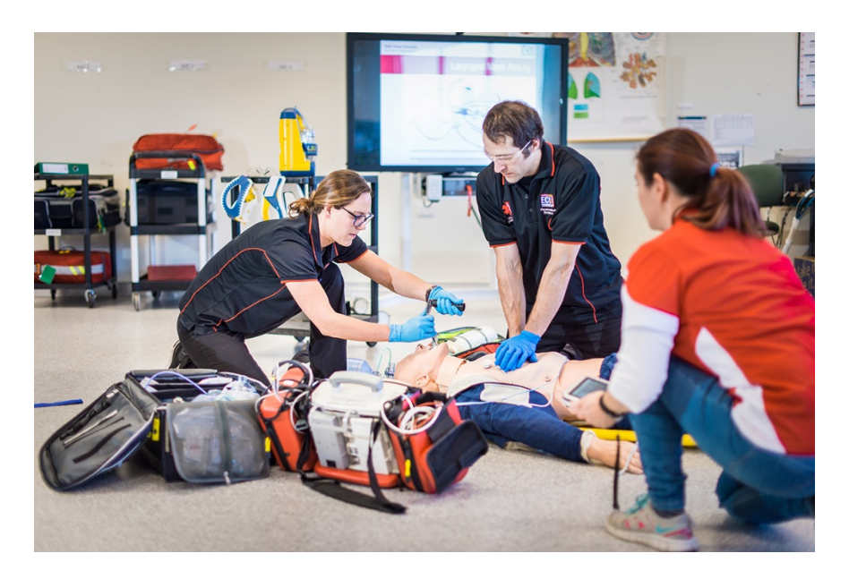
Using a state of the art manikin and defibrillator which is the same as that used by Paramedics in an emergency situation