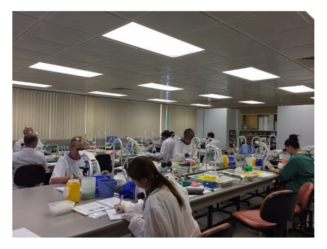
Semen analysis laboratory in progress associated with the Master of Assisted Reproductive Technology and also 3<sup>rd</sup> Year Human Reproduction, Development and Ageing unit.