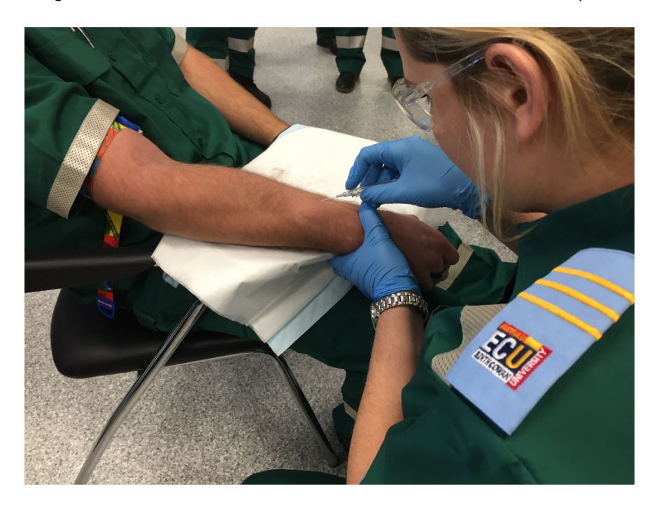
Students learn the specific techniques to safely cannulate a patient in an emergency situation. Before performing this on a live person (as illustrated) students practice extensively on dummy arms.