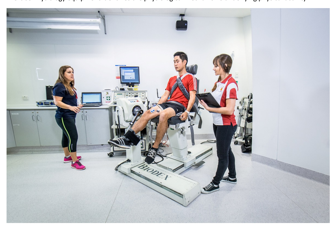
Researchers measuring muscle strength using the Biodex