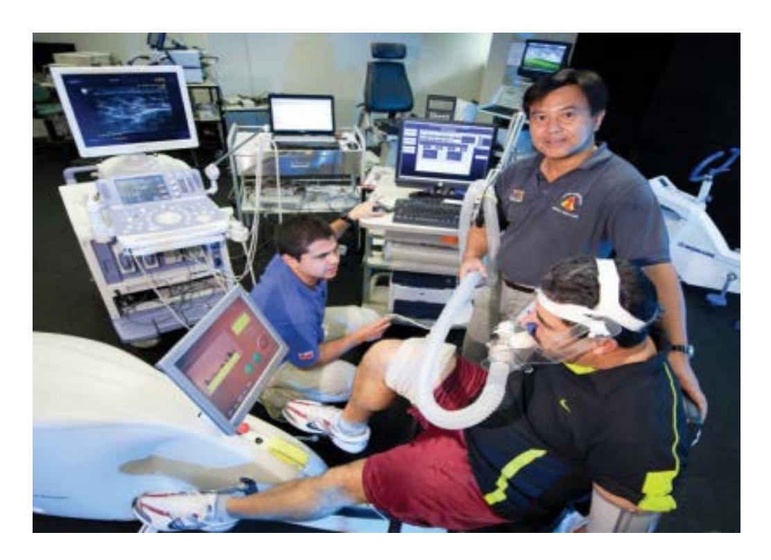
Exercise Physiology equipment identifies the physiological mechanisms underlying physical activity