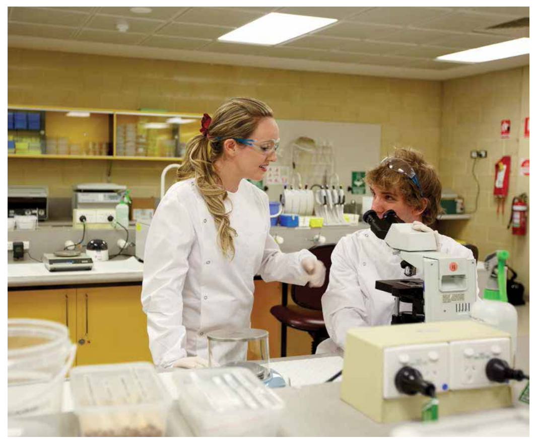
Students in 17.222 using the microscope to view a preparation of their chromosomes!