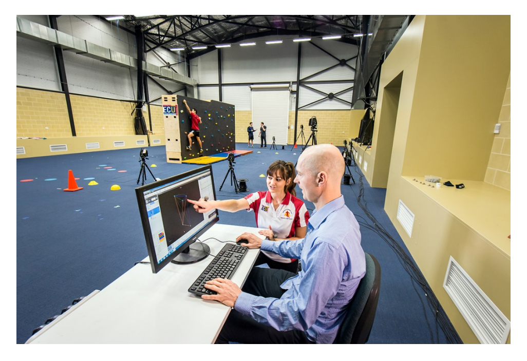
3D motion capture being used to understand how children's perception of how far they can reach affects how they play