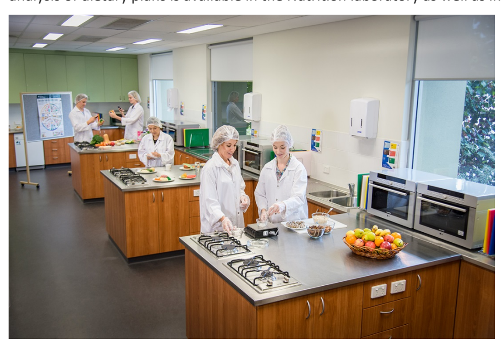
Preparing foods for analysis

The dedicated nutrition laboratory is designed for students to work on practical projects involving food. The multi-functional laboratory has a food demonstration and teaching area, computing stations for dietary analysis and diet development and individual or group work areas for food preparation, cooking and tasting, and food analysis. Students have access to small equipment such as microwave/convection heating facilities, gas hotplates, modern freezers, automatic dishwashers, gelometers, and anthropometric equipment for nutritional assessment. Computer software for dietary analysis of dietary plans is available in the Nutrition laboratory as well as in the e-Labs.