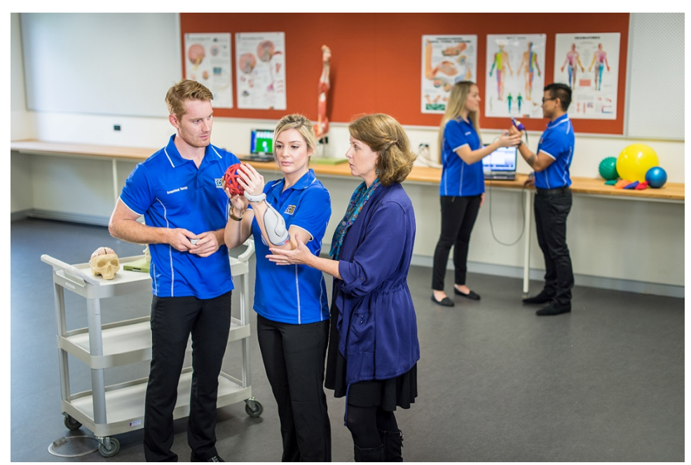
ECU students have access to the latest technology in rehabilitation. Students in the Occupational Therapy course learn to use the Bioness H200 (seen here) which offers a wireless option for functional electrical stimulation. As evidenced in the literature, such stimulation can be used to ensure adequate repetition and intensity of rehabilitation to enhance upper limb function in adolescents and adults following neurological illness/injury.

The Assistive Technology lab has computers with cutting edge assistive technology software programs and is used for teaching upper limb orthotics, wheelchair and seating prescription. A large carpeted laboratory room is used for teaching paediatrics, group work and counselling.