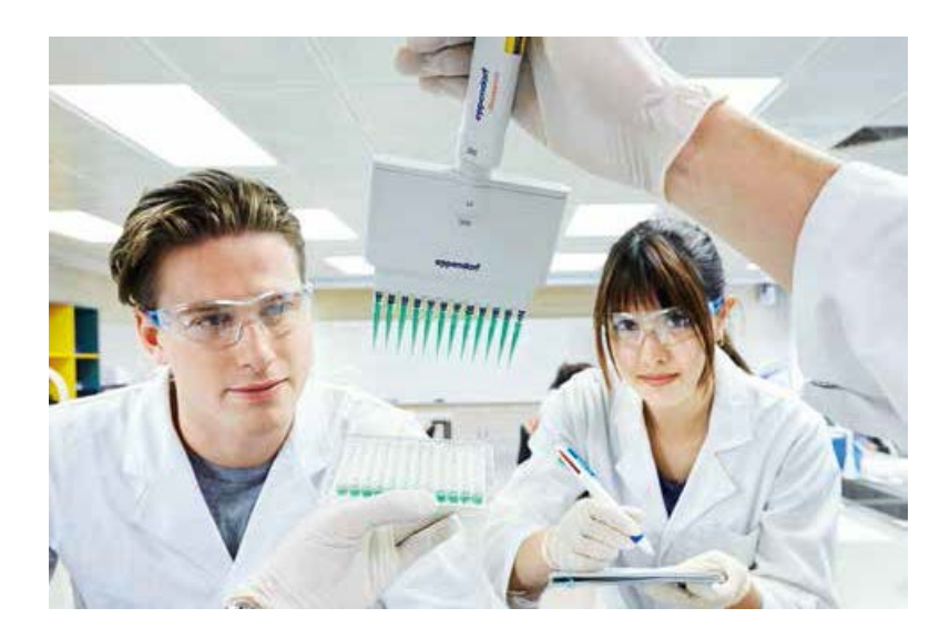
Students in 17.222 performing techniques in the Immunology unit