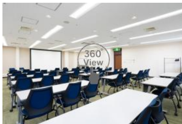
Lecture / workshop Room