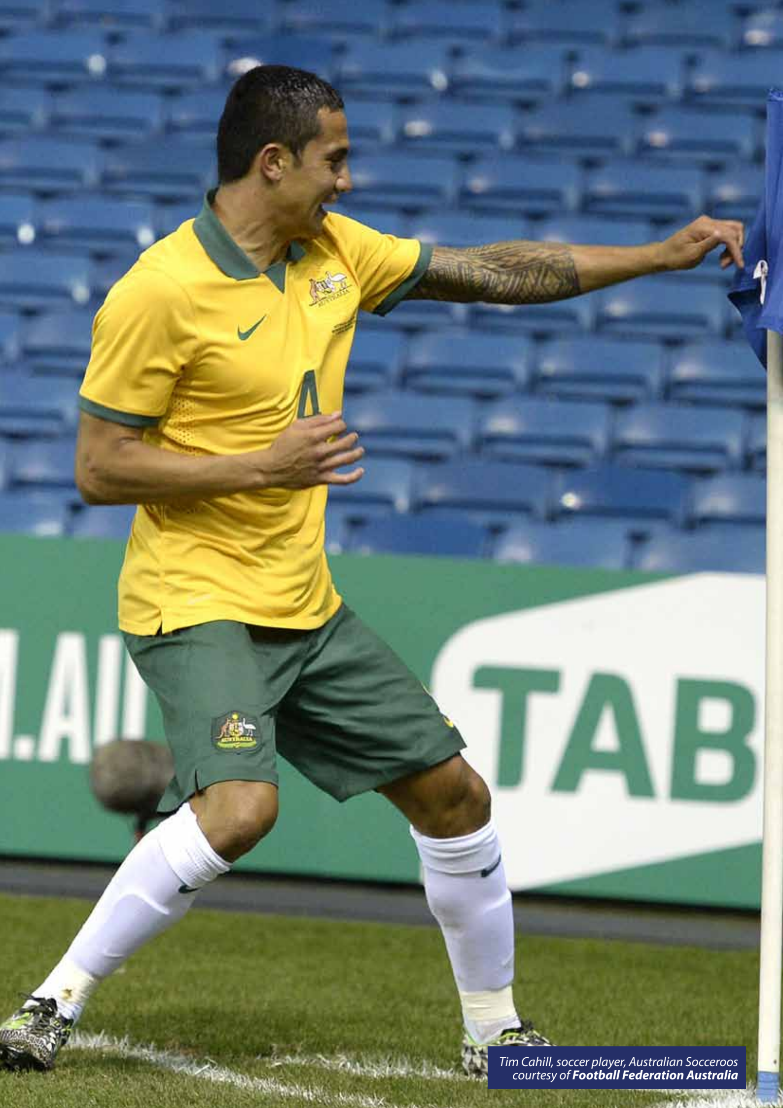
Tim Cahill, soccer player, Australian Socceroos