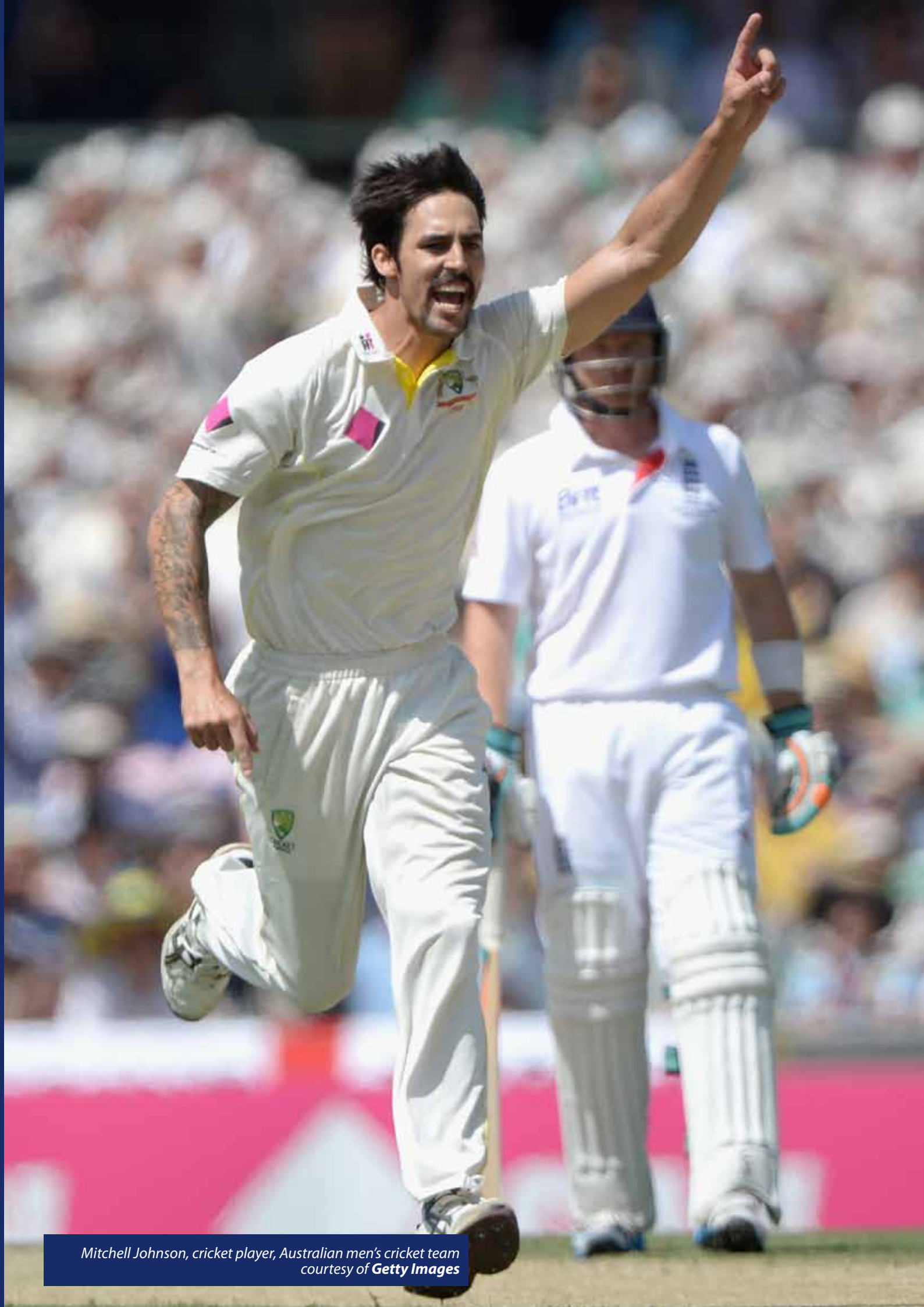
Mitchell Johnson, cricket player, Australian men's cricket team