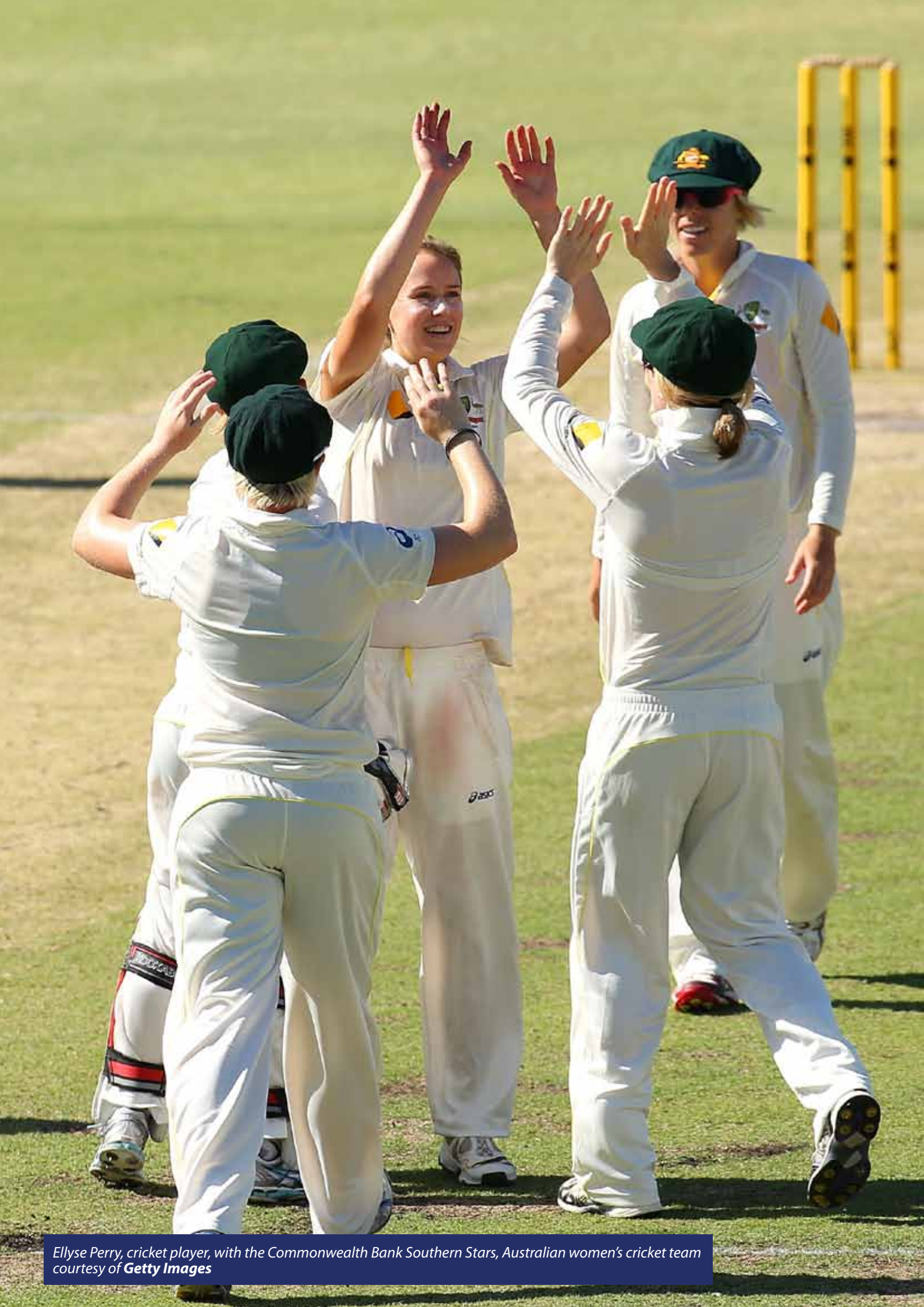
Ellyse Perry, cricket player, with the Commonwealth Bank Southern Stars, Australian women's cricket team