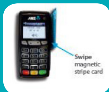
Swipe magnetic stripe card