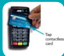
Tap contactless card

Tap, swipe, or insert your EFTPOS debit or credit card.