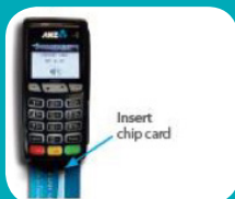
Insert chip card

Select your account, type your PIN, then press 'Enter'.