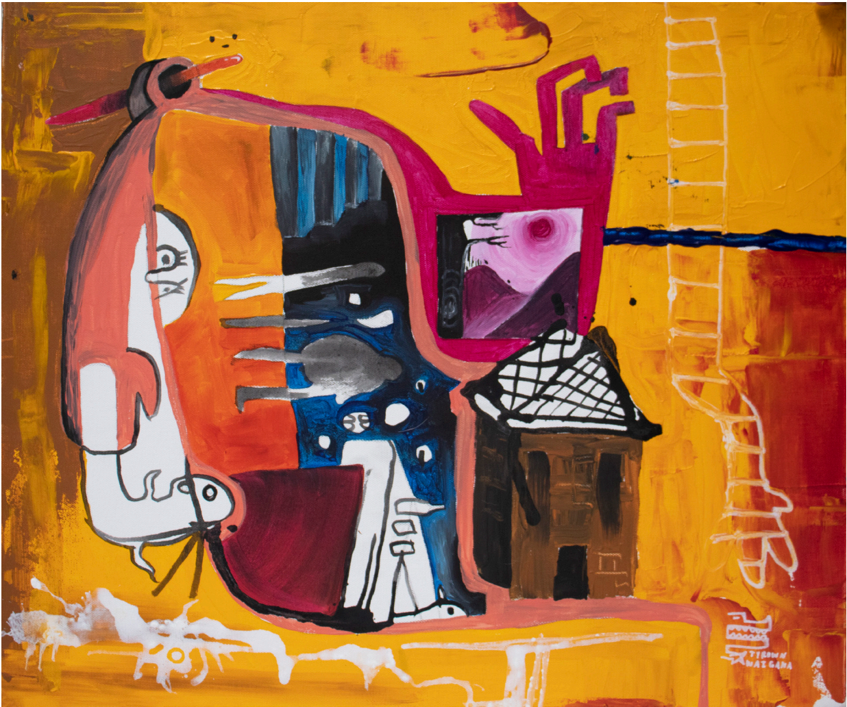
Image: Tyrown Waigana, 2021, A Nice Place to Hate Yourself , 61 x 51 x 4 cm

This symposium runs alongside the Gallery25 & THERE IS exhibition, Dark Side curated by Ted SNELL and featuring artists: